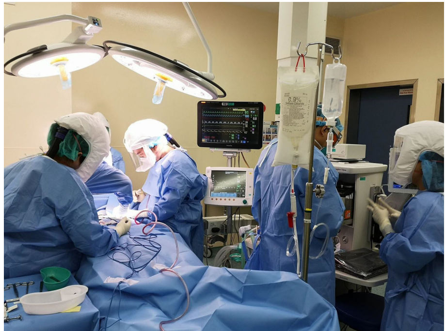
Fig. 3 High-touch equipment within the operating room are wrapped with plastic sheets to facilitate decontamination. A) Anesthesia workstation. B) Back of anesthesia workstation. C) Exposed surfaces wrapped with plastic. D) Laptop for nursing documentation