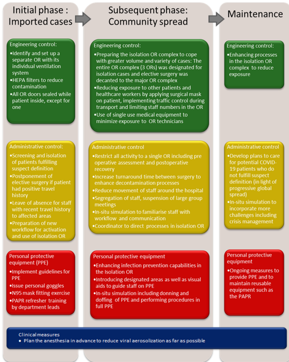
Fig. 6 Summary of the measures implemented in the operating room and anesthetic department to enhance infection prevention in a COVID-19 pandemic

should be used as ORs for surgical patients who had airborne infections. 28 Nevertheless, in our institution, all the ORs are positive pressure rooms and we did not have AIIR which could be used as ORs. Therefore, a separate OR complex was set aside for surgery involving COVID-19 patients. Disposable anesthetic and surgical equipment