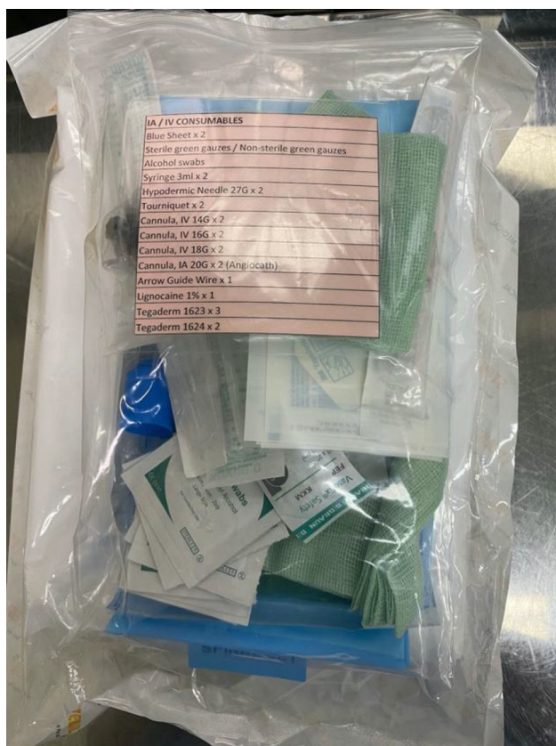
Fig. 4 Pre-packed sets of equipment

problems that were not apparent in the initial planning, such as lack of oversight and coordination, environment limitations, unsatisfactory equipment set-up, communication difficulties, lack of familiarity with protective equipment, infection control breaches, and inadequate support during crisis. These led to many downstream interventions, including appointing an OR coordinator to oversee this multi-step and multidisciplinary activation process to ensure that essential steps that may