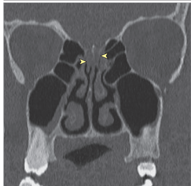
Figure 1. Nasal Cavity Computed Tomographic Image of Coronal Section

Bilateral obstruction of the olfactory cleft (yellow arrowheads) without obstruction in the rest of the nasal cavities.